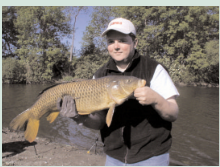
A typical carp that can be caught from The Islands